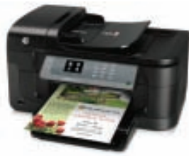
HP Officejet 6500A Special Edition e-All-in-One

Get professional colour and laser performance at a low cost per page. Print from mobile devices with HP ePrint 2 . Built-in networking and auto 2-sided printing options available 3 . (Wireless 4 and 2-sided printing on HP Officejet 6500A Plus only)