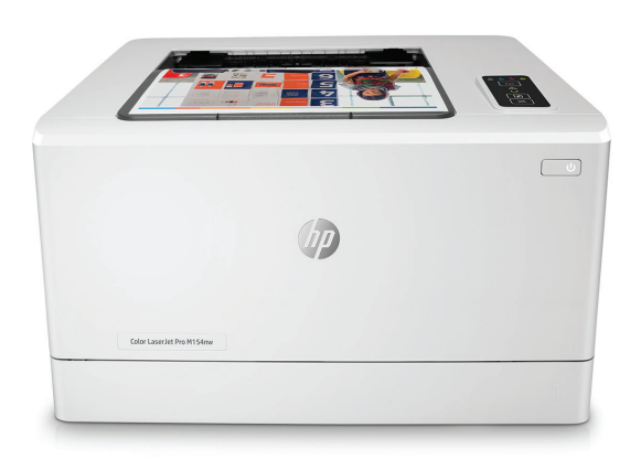
HP Colour LaserJet Pro M154nw