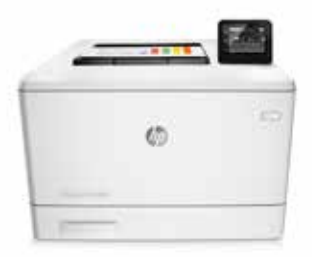
HP Color LaserJet Pro M452dw