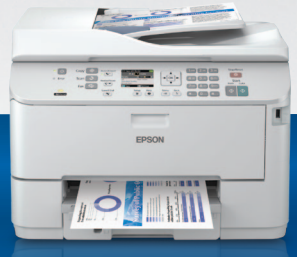
Epson WorkForce Pro WP-4521

The Epson WorkForce Pro multifunction printers deliver fast and high quality prints with their highly durable Epson Micro Piezo™ print heads, along with all the flexibility and networking features you need for optimum workgroup productivity.