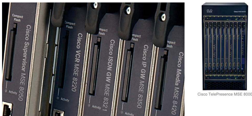
Figure 1. Cisco TelePresence MSE 8000