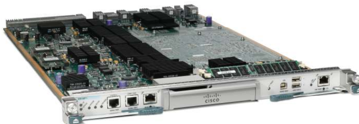
Figure 1. Cisco Nexus 7000 Series Supervisor Module

The Cisco® Nexus 7000 Series Supervisor Module (Figure 1) scales the control plane and data plane services for the Cisco Nexus 7000 Series system in scalable data center networks.